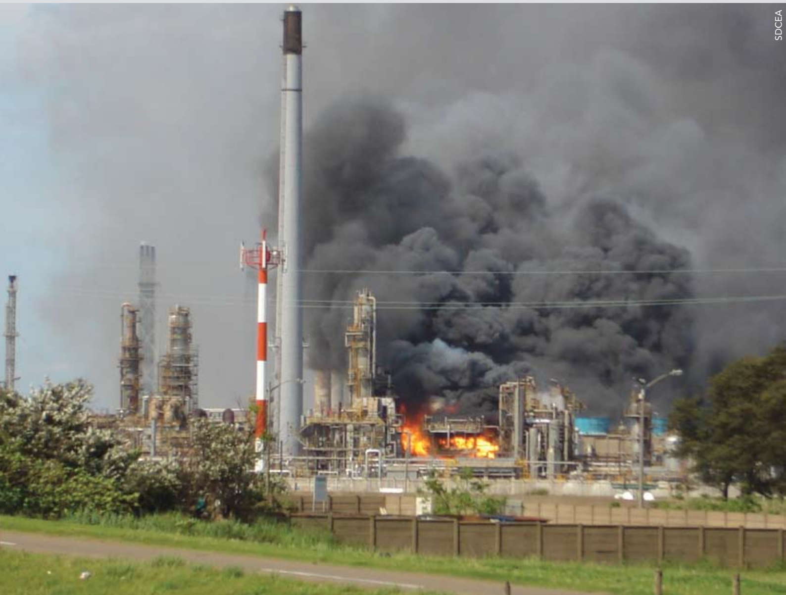
Fire at Sapref refinery in Durban, South Africa.