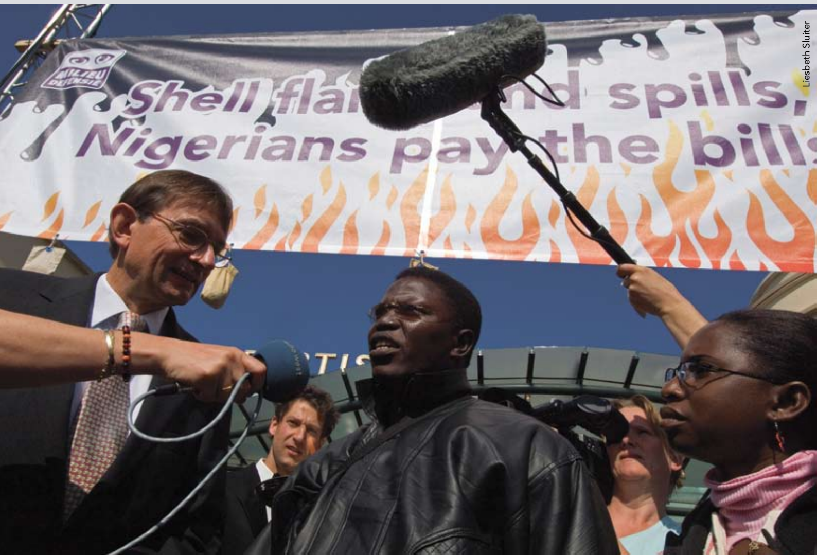
Action Milieudéfense at AGM Shell, May 2006.