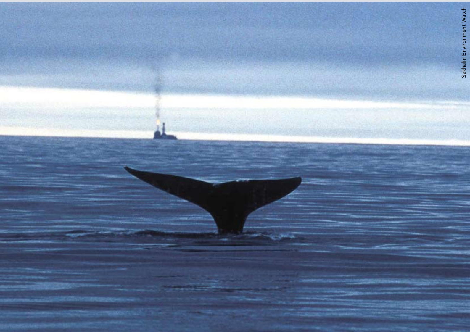
Pacific Gray whale, Sakhalin.