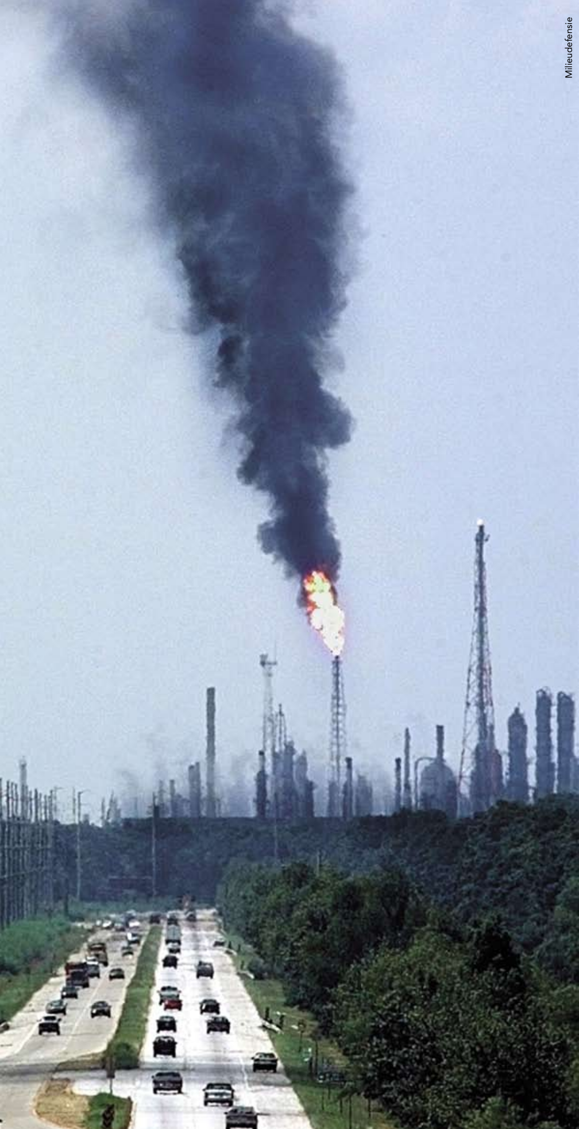
Gas flaring in Norco, Louisiana, USA