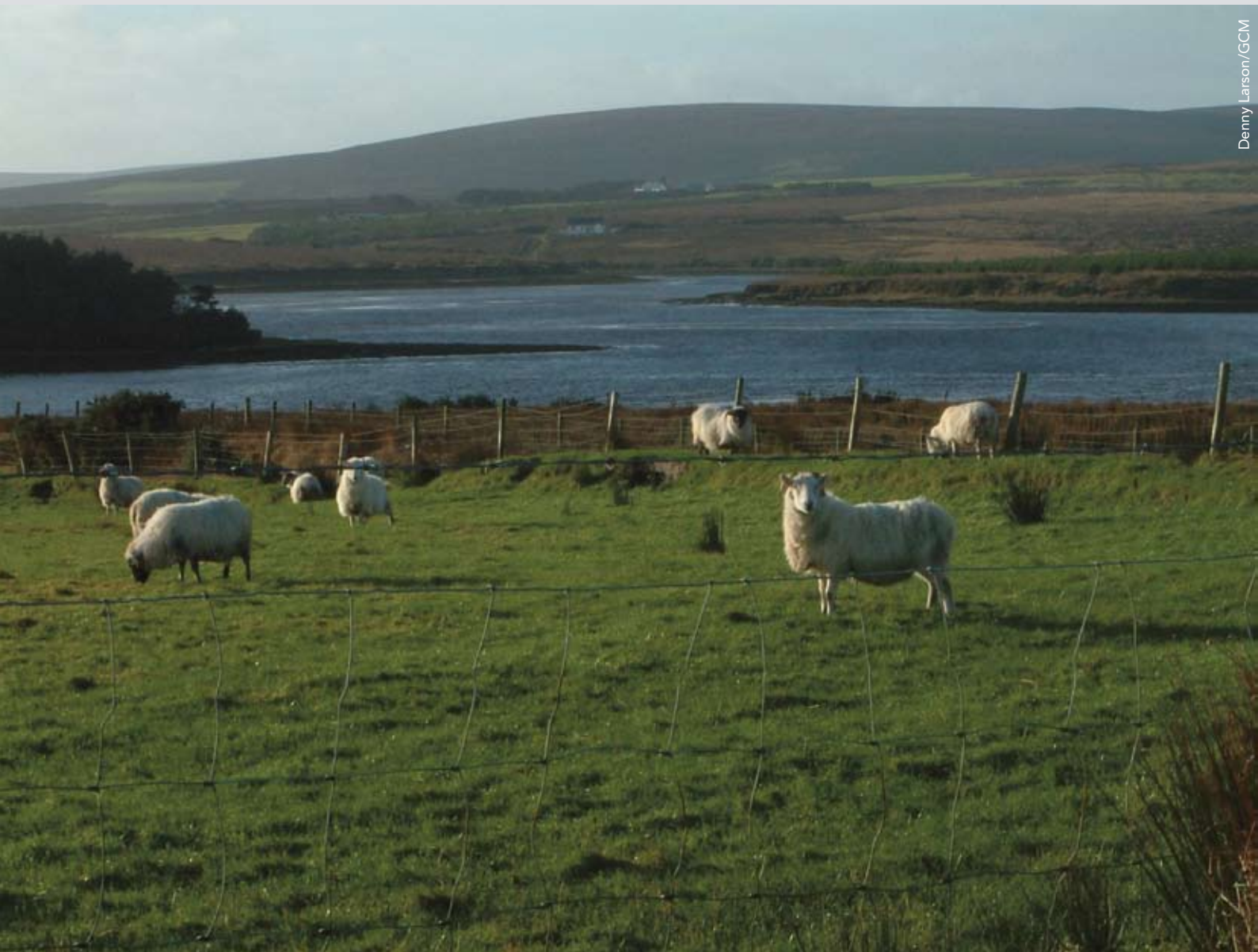
Farmland in Rosport, Ireland.