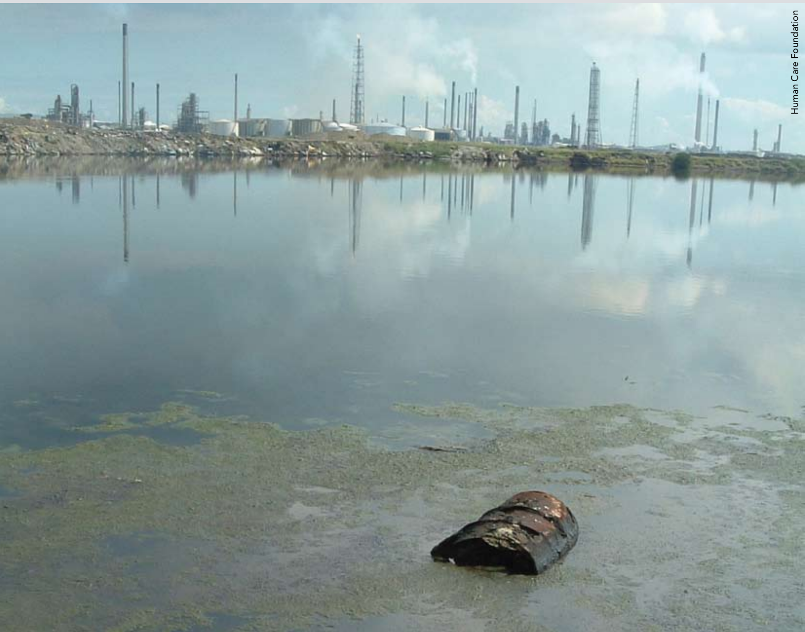
Polluted "lake Asphalt" on Curacao.