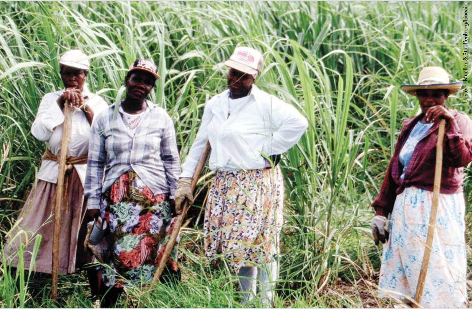
Sugarcane on Barbados.