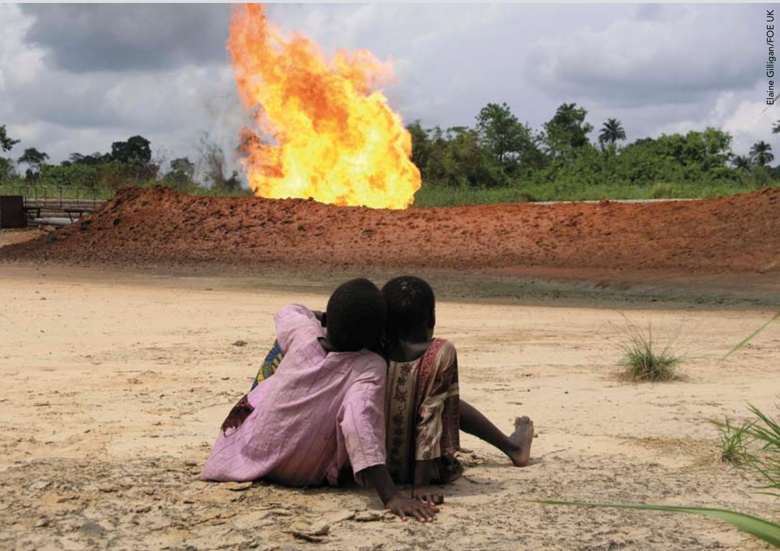
Children look at gas flaring in the Niger Delta, Nigeria.