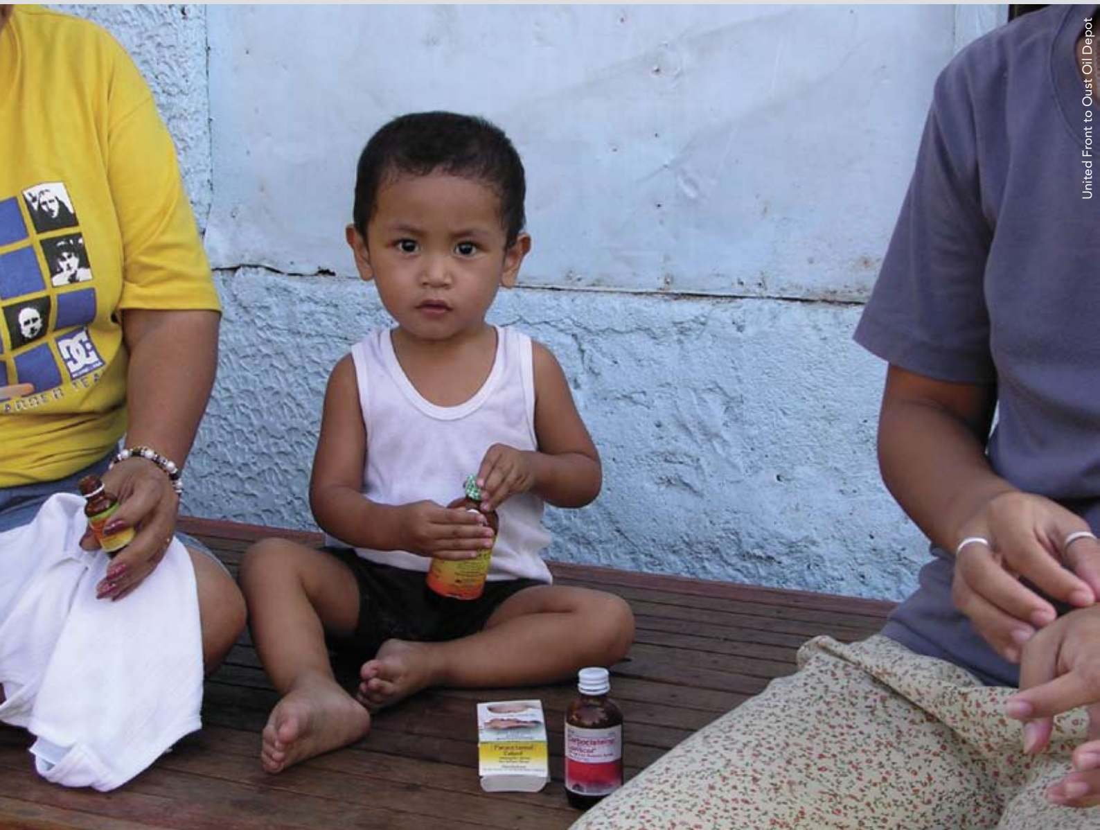
Child with medication, Philippines.